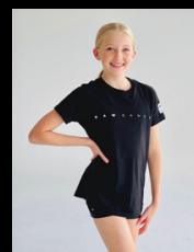
RAW Logo Tee